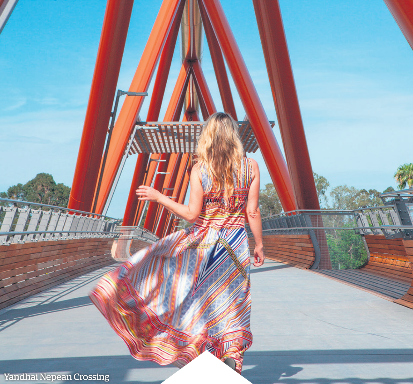
Yandhai Nepean Crossing