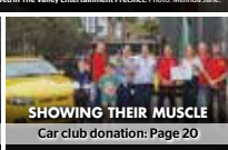
SHOWING THEIR MUSCLE Car club donation: Page 20