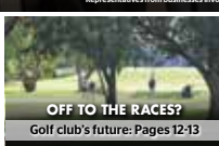
OFF TO THE RACES? Golf club's future: Pages 12-13