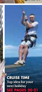
CRUISE TIME Top idea for your next holiday SEE PAGES 20-21