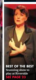
BEST OF THE BEST Stunning show to play at Riverside SEE PAGE 23