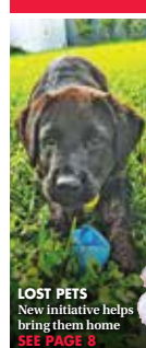
LOST PETS New initiative helps bring them home SEE PAGE 8