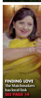
FINDING LOVE The Matchmakers has local link SEE PAGE 14