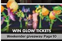
WIN GLOW TICKETS Weekender giveaway: Page 10

Representatives from businesses involved in The Valley Entertainment Precinct.